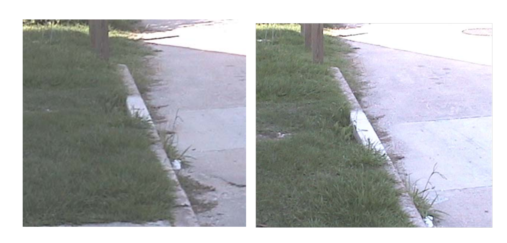
Find the Hazard. Determine the risk of injury. Determine protective steps.