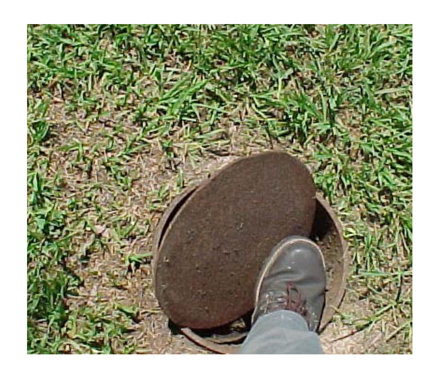
Corrective action: which is better?