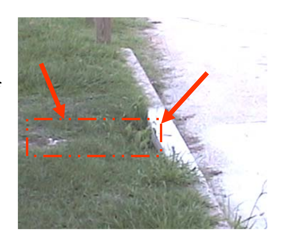
IF ANY of the steps are missed. An injury can occur