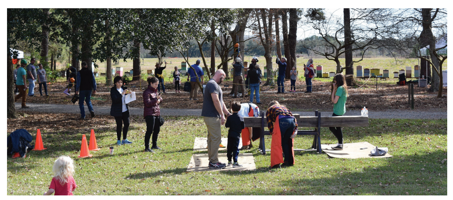
Arbor Day activities in full swing.