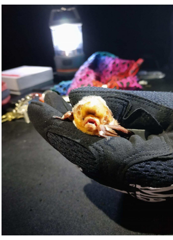
Eastern red bat