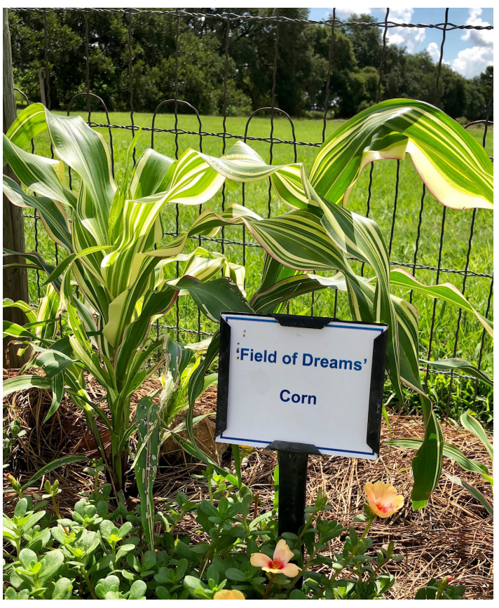
Field of Dreams corn growing in the Children's Garden

Fall field trips begin the end of September and run through the first week of December, weather permitting. Our docents have met to review the program script and materials and to make any suggestions to further enhance the educational experiences for the students. Our Trail Masters and staff have done an amazing job readying the trails for the students and other hikers. The field trips resume the second week of March and continue until the first week of May. If you were unable to attend the orientation meeting but are interested in volunteering as a docent, please contact me at srayner@agcenter.lsu.edu or 225-763- 3990 extension 3. I am looking forward to seeing you all at our Botanic Garden programs and events!