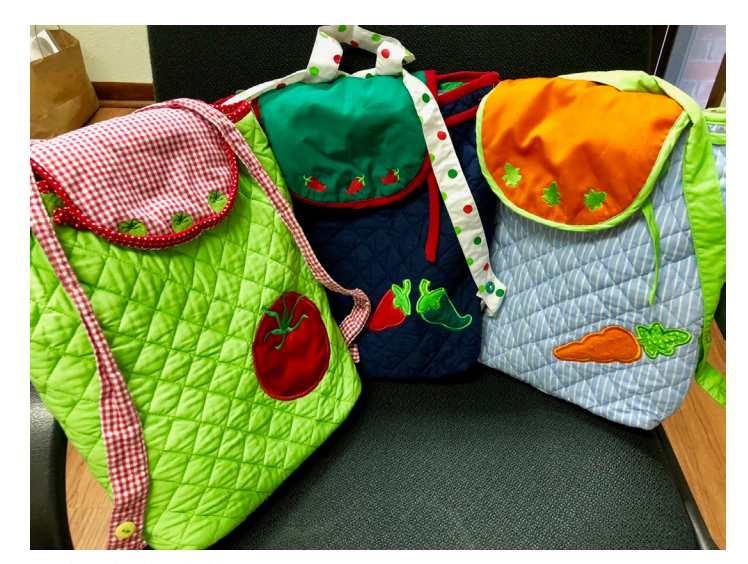
Backpacks for Children's Garden activities

Fall field trips begin the end of September and run through the first week of December, weather permitting. Our docents have met to review the program script and materials and to make any suggestions to further enhance the educational experiences for the students. Our Trail Masters and staff have done an amazing job readying the trails for the students and other hikers. The field trips resume the second week of March and continue until the first week of May. If you were unable to attend the orientation meeting but are interested in volunteering as a docent, please contact me at srayner@agcenter.lsu.edu or 225-763- 3990 extension 3. I am looking forward to seeing you all at our Botanic Garden programs and events!