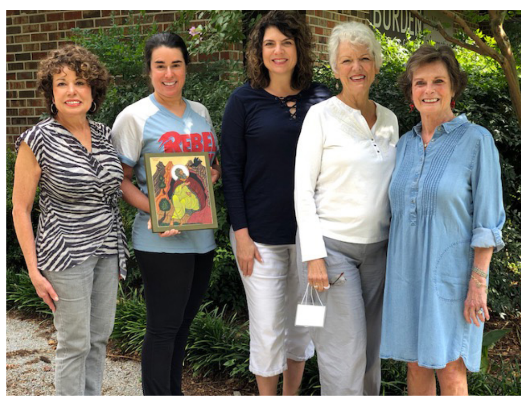
Workshop becomes a family affair as mothers, daughters and sisters participate together.