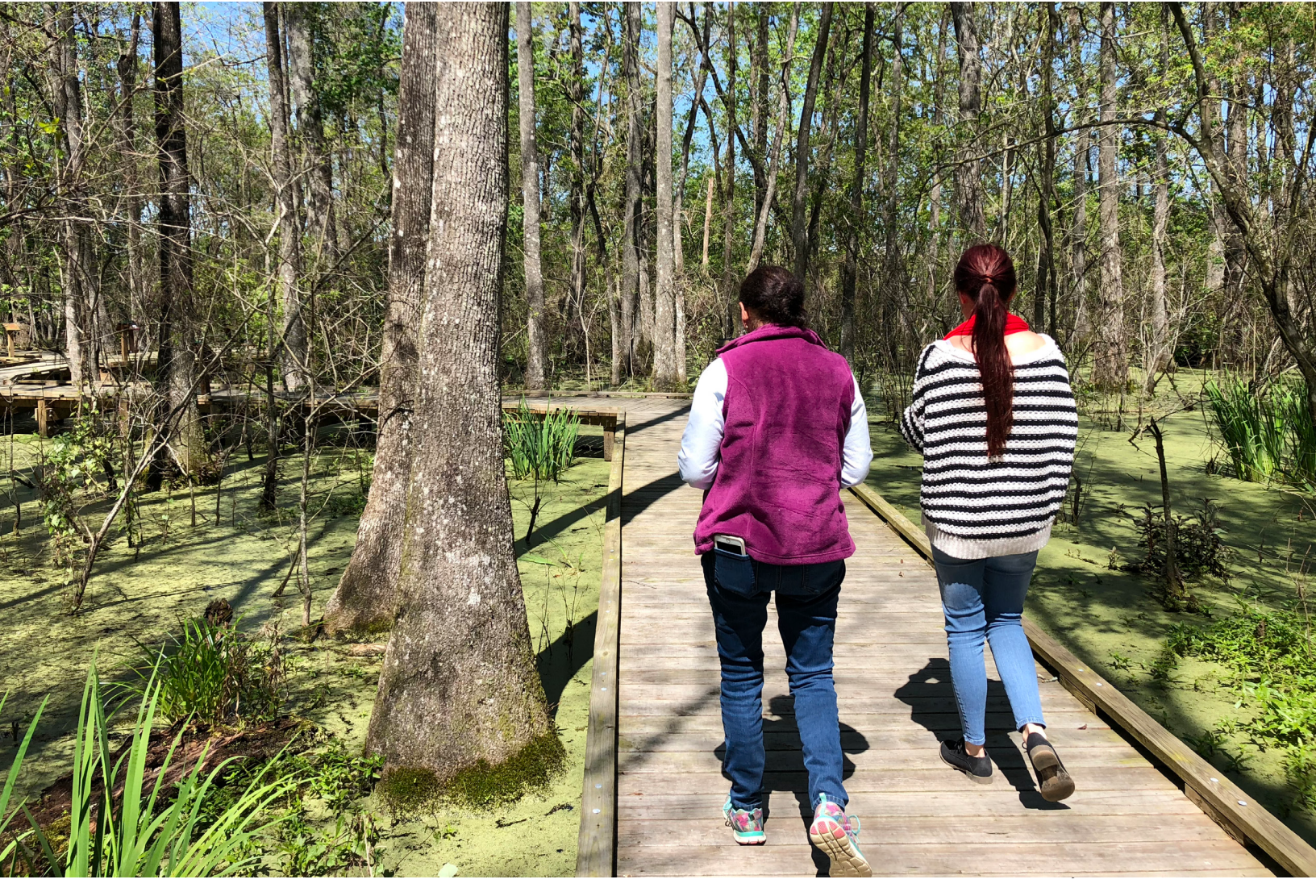
Trees & Trails and More