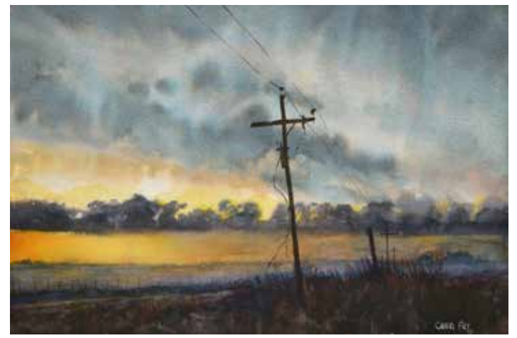
"Connected" by Cheri Fry

In reflection they noted the steps they've made so far, such as the move to use an online service to accept and process the call for entries, the investment in attractive and stable panels to display art in the Orangerie, the purchase of professional rods and clips for hanging art and photographs at various heights in various places, and most importantly the formation of subcommittees within the Brush for Burden committee to divide and conquer the myriad of responsibilities that need to be addressed to ensure the con-