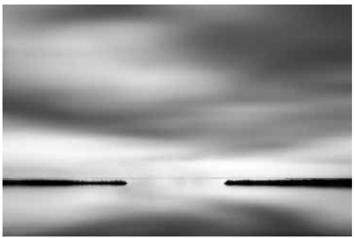
"Quiet Beauty" by Dede Lusk