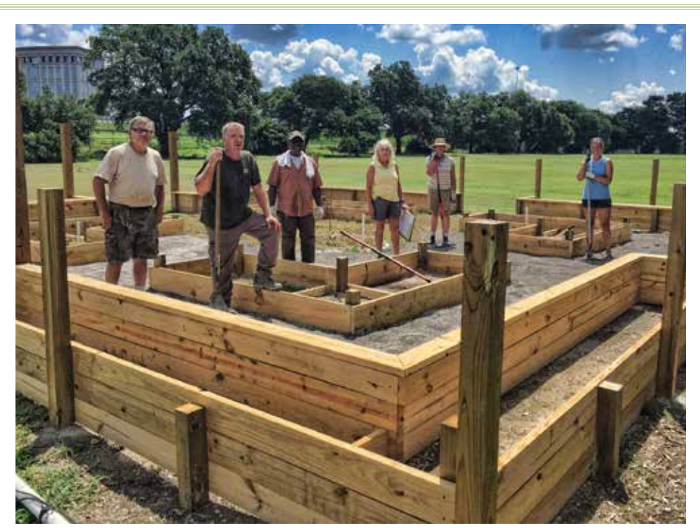
The first phase of the Herb Garden being built by the Burden Gardens Staff supported the Baton Rouge Unit of the Herb Society

LSU AgCenter Botanic Gardens Has Gone Green!!!! You may have noticed the new recycle bins in the lobby and in the kitchen. We are recycling paper, cans and plastic. Please be kind to Mother Earth and use the receptacles provided.