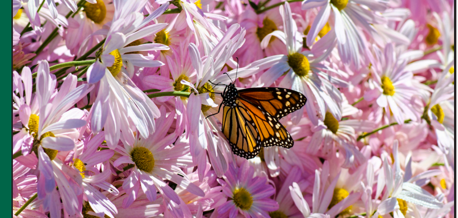
Chrysanthemum ( Dendranthema x grandiflorum)