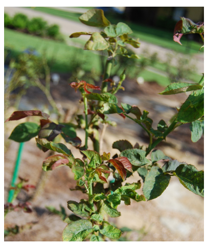
Distorted new growth after pruning is an indicator of chilli thrip infestation.

It is possible that insects will appear on roses in fall, but insects are more of an issue in spring and summer. Scout plants once weekly. Spider mites, aphids, flower thrips and cucumber beetles are usually the main problem insects on roses. A new insect causing major problems on roses in Louisiana is chilli thrips. These are foliage-feeding thrips instead of flower-feeding thrips. They are hard to identify and hard to con-